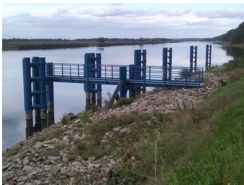
Table 2. Summary of monitoring indicators used in the implementation of Task 1B.3/2 implemented by PGW WP – RZGW in Szczecin

The Investor provided PAP with the prepared opinion and obtained approval both in terms of the method of determining the amount of compensation and its final result through the PAP statement of November 26, 2020. The conclusion of a new lease agreement was sufficient to meet the expectations of the PAP. Due to the fact that only part of the real property is designated for the investment project, the situation of the lessee from before the commencement of the investment project has not changed. Consequently, the impact on the PAP was assessed as insignificant, and the actions taken by the Investor were considered sufficient. In fact, the small part of the real property occupied was not used by the lessee for agricultural purposes due to its location directly by the river bank (photo below).